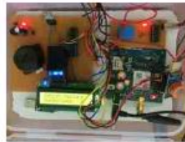
ABOLI WAIKOS NILESH MANE SATISH KASTURE

For more safety option for user of bike we also provide alcohol sensor that is MQ3 and limit switch as a helmet detector with the help of this the drunk person cannot bypass the system and when user wears the helmet and not consume any alcohol only then and then that person can handle the bike.